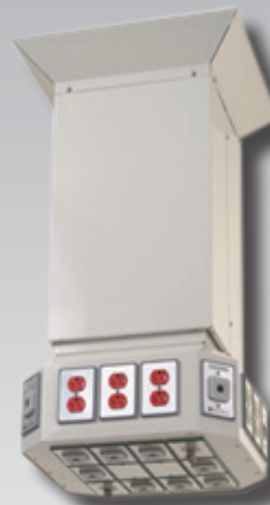
Pneumatic Retractable Type