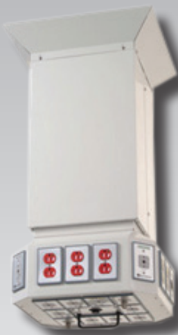
Manual Retractable Type