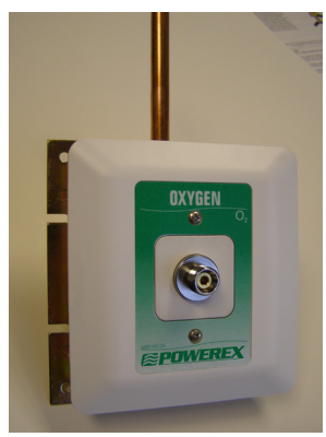
Part Number PX-XF1124A shown

The medical gas outlets shall be designed so that, once installed, routine service of both the primary and secondary check valves can be accomplished without removing the nameplate or gas specific portions. The primary check valve shall be unitized and of the cartridge type. To allow the primary check valve to be removed for service without shutting off the gas supply to the outlet, the secondary check valve shall operate automatically to stop the free flow of the positive pressure gas. There shall be no secondary check for vacuum or WAGD services. Medical gas outlets which require the removal of the nameplate or gas specific components for routine service shall not be acceptable.