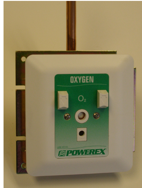
Part Number PX-XA1124 shown

The name of the gas service shall be permanently marked on the outlet bracket and the outlet. The outlet's rough-in supply tube shall be a 7 inch (18 cm) length of ½ OD copper